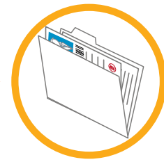
Figure 1. HP Document Capture for Admissions and Electronic Medical Records solution

Bar code links to patients admissions documents and records